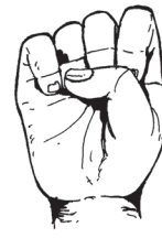
0 Fingers (No fingers open)

Now, go through the pages 66–67 for providing more practice to the students.