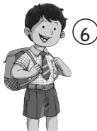
Takes his bag