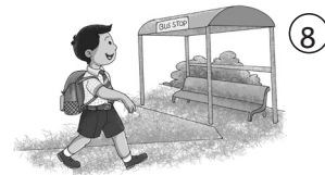
Goes to the bus stop