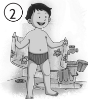
Takes a bath